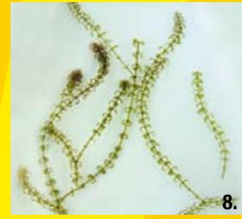
Elodea nuttallii Nuttall's waterweed