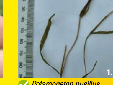
Potamogeton pusillus Lesser pondweed