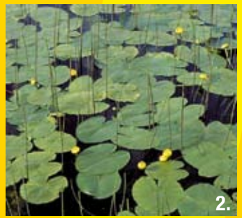
Nuphar lutea Yellow water lily