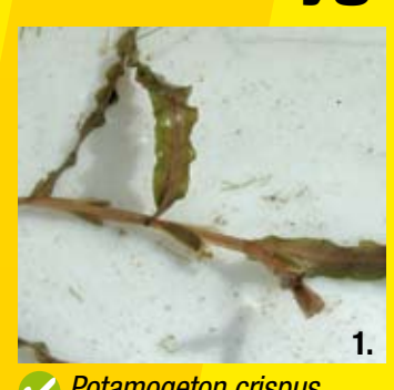
Potamogeton crispus Curled pondweed