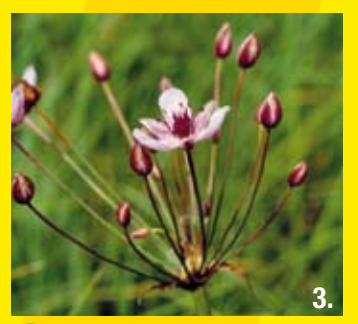
Butomus umbellatus Flowering rush