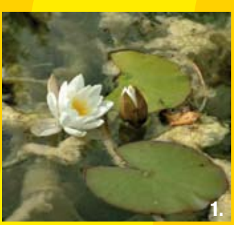
Nymphaea alba White water-lily