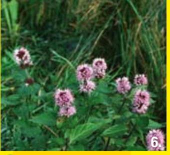
Mentha aquatica Water mint