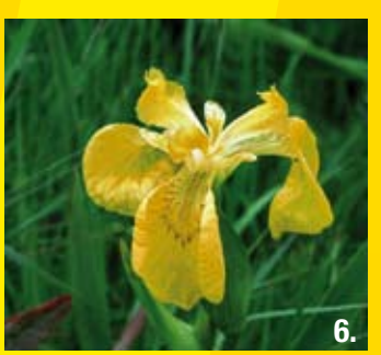
V Iris pseudacorus Yellow flag iris