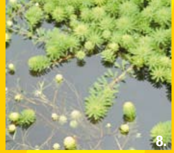
Myriophyllum aquaticum Parrot's feather