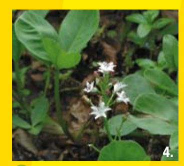
🕖 Menyanthes trifoliata Bogbean