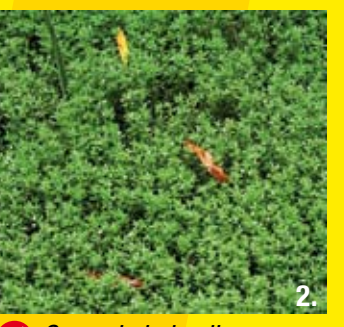
Crassula helmsii New Zealand pigmyweed