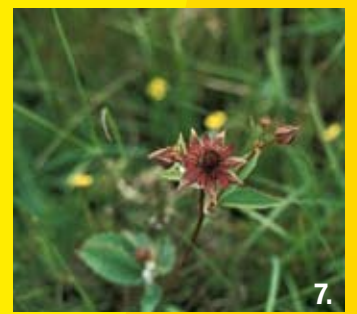
Potentilla palustris Marsh cinquefoil