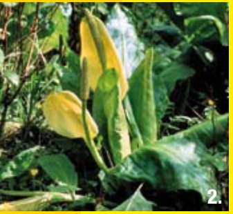
X Lysichiton americanus American skunk cabbage