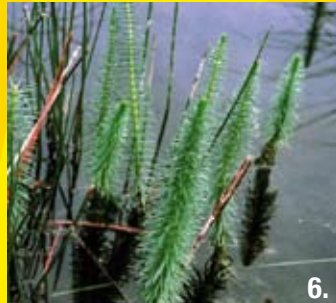
Hippuris vulgaris Mare's tail