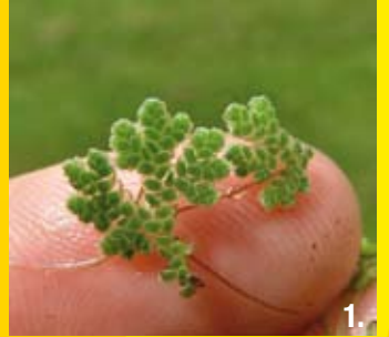
X Azolla filiculoides Water fern