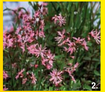
Lychnis flos-cuculi Ragged robin