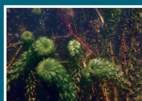
AFRICAN CURLY WATERWEED