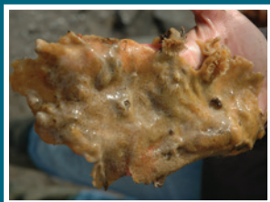
CARPET SEA SQUIRT

Report any invasive species you find, including: