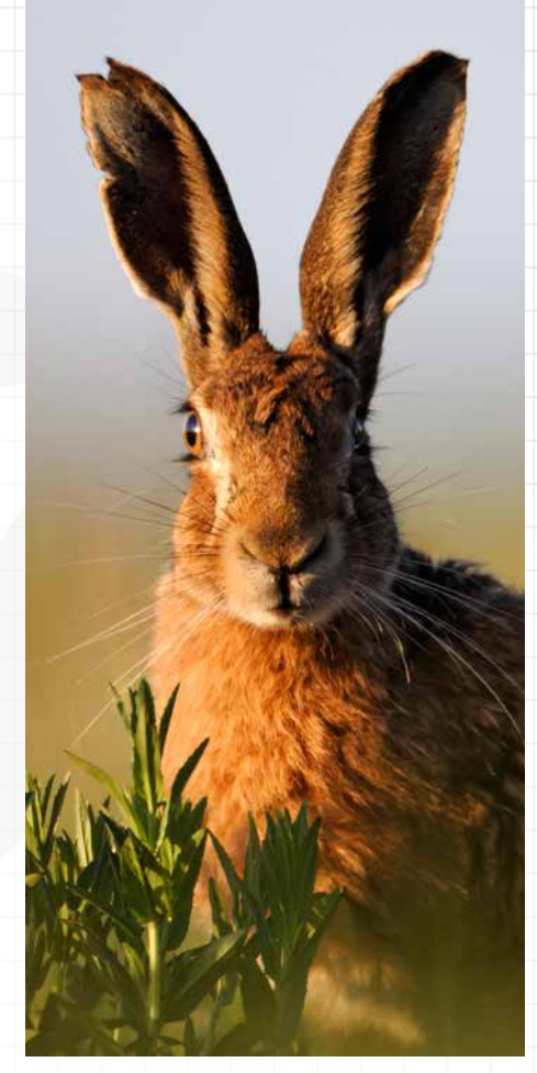
Long ears with more extensive black tips than similar species in Ireland