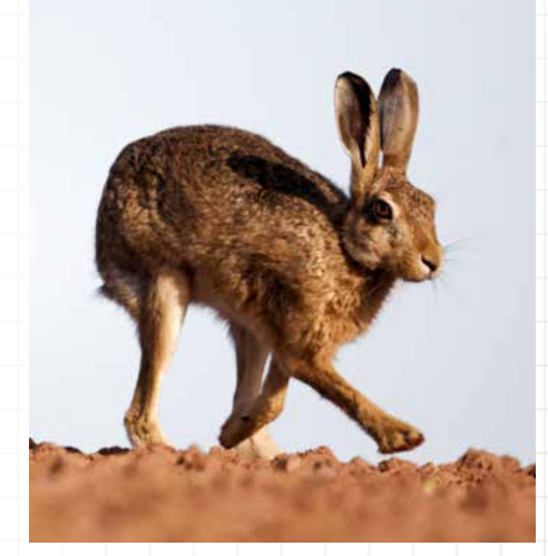
Showing it's stride rather than a rabbit like scuttle