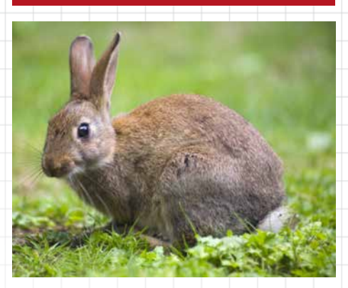
European rabbit (Oryctolagus cuniculus)