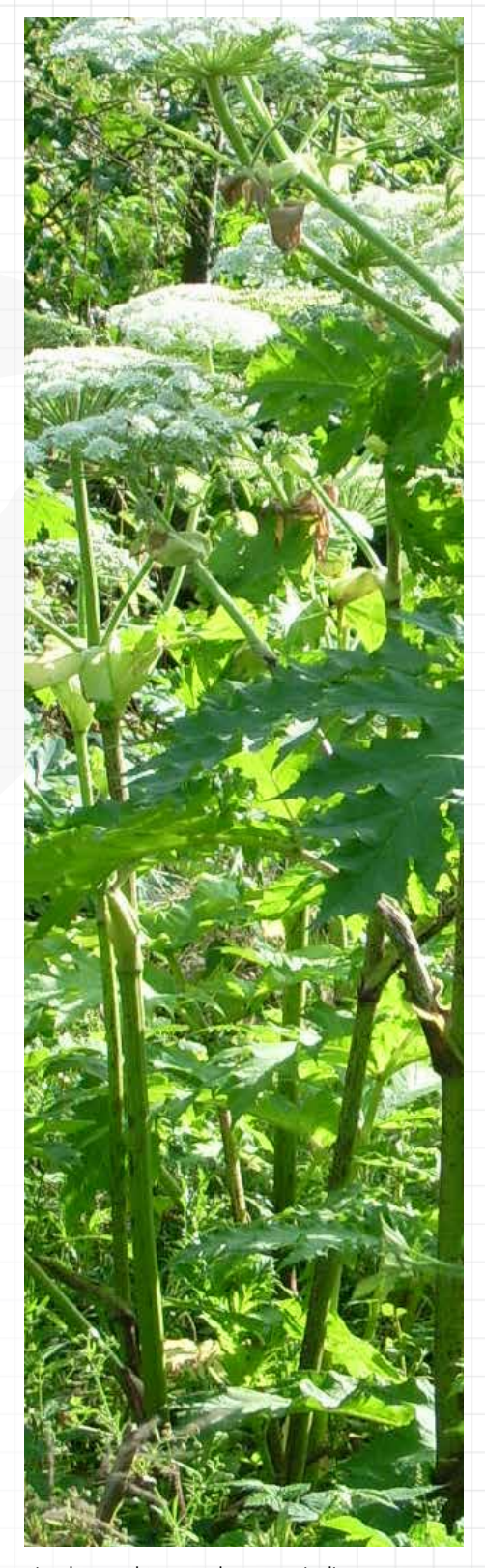
Giant hogweed Stem can be 5-10cm in diameter