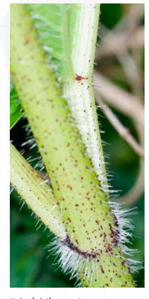
Hairy bristles on stem