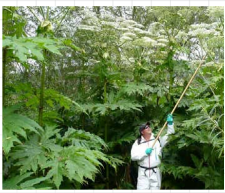
Spraying of giant hogweed