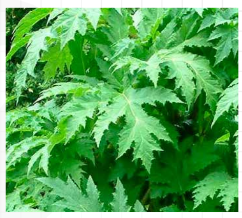
Giant hogweed