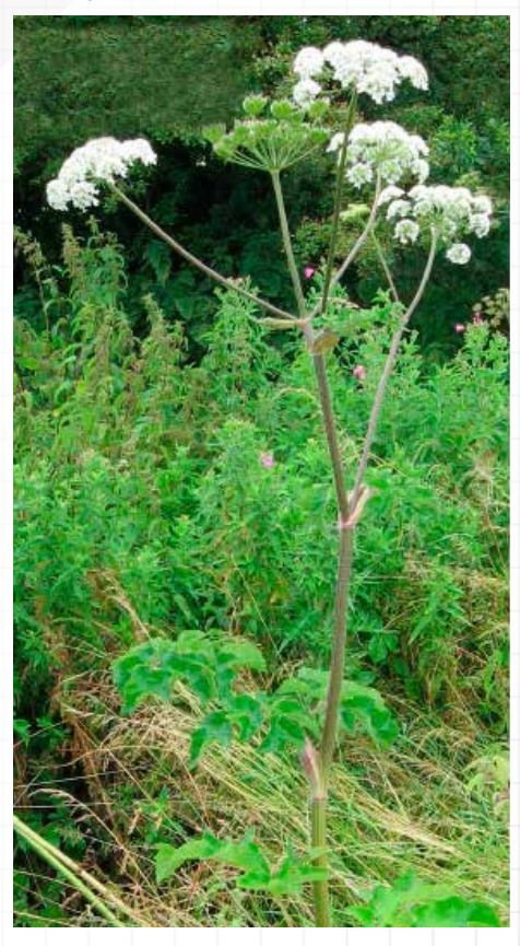
Hogweed, which is a native plant