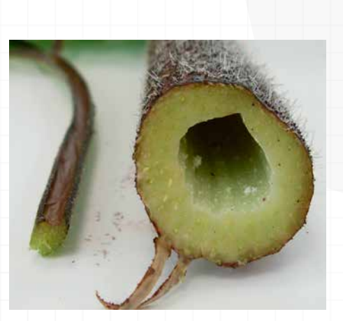
Cross section comparison of a hogweed (left) and giant hogweed (right)