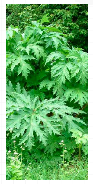
Deeply serrated and large leaves