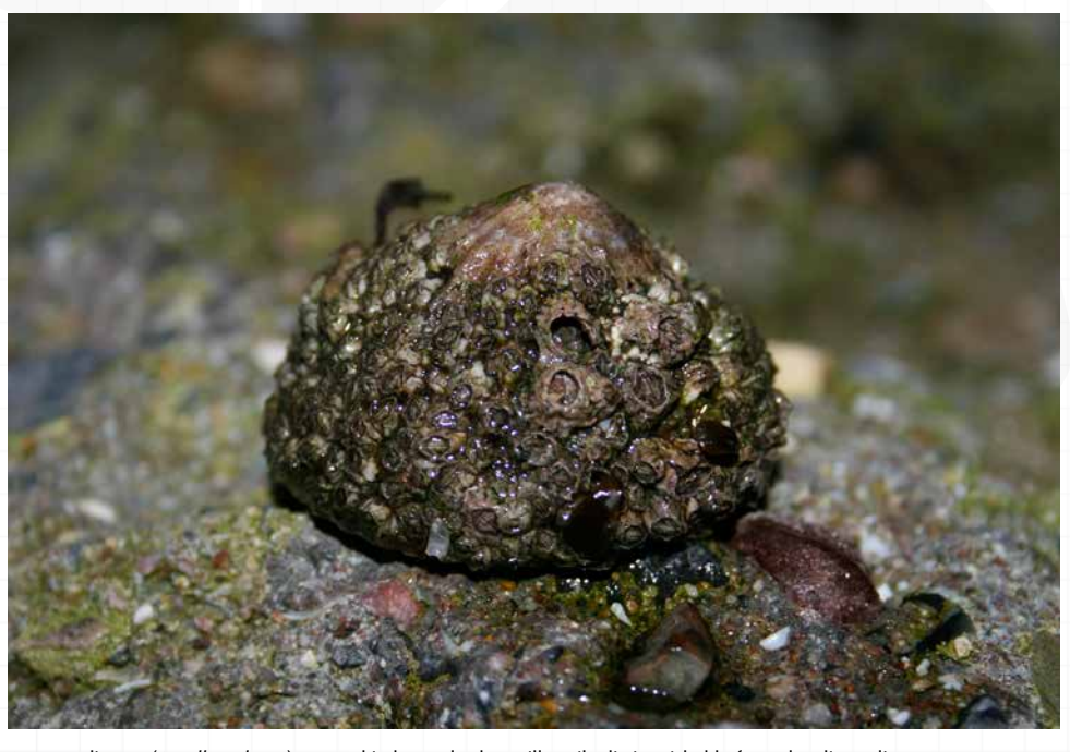
Common limpet ( Patella vulgata ) covered in barnacles but still easily distinguishable from the slipper limpet