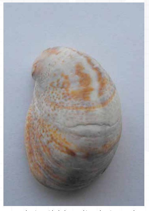
Cream colouring with darker markings showing growth lines and a curved shell

Attachment: The species attaches to objects with its muscular foot. Can survive several days in cool, damp conditions. Conditions: