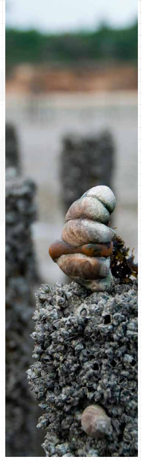
Slipper limpet showing chain formation which aids with reproduction