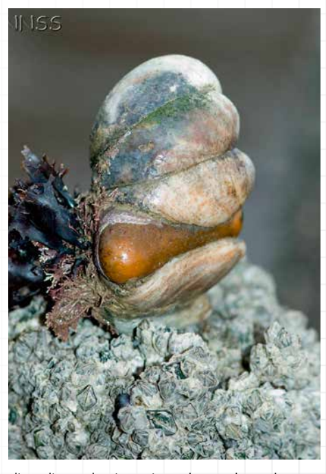
Slipper limpet showing various colours and curved shell