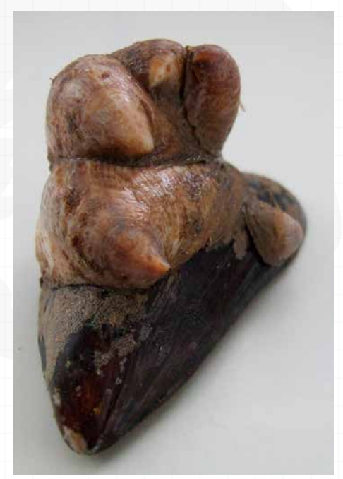
Showing the tapering of the shell to a single point