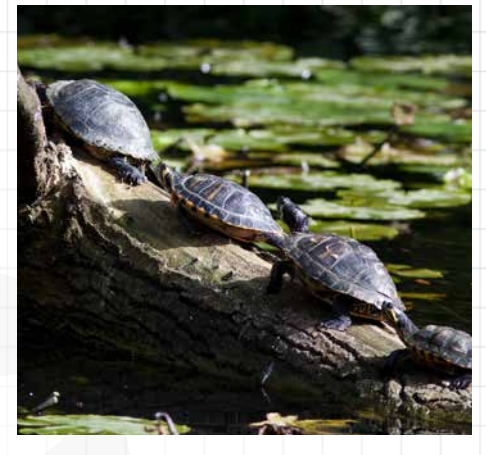
Red eared slider (top) and 3 yellow-bellied sliders, showing various markings - Shay Connolly