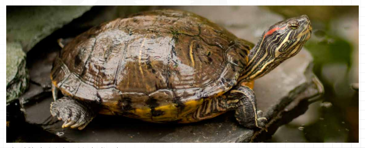
Red-eared slider, showing its characteristic red marking at the ear