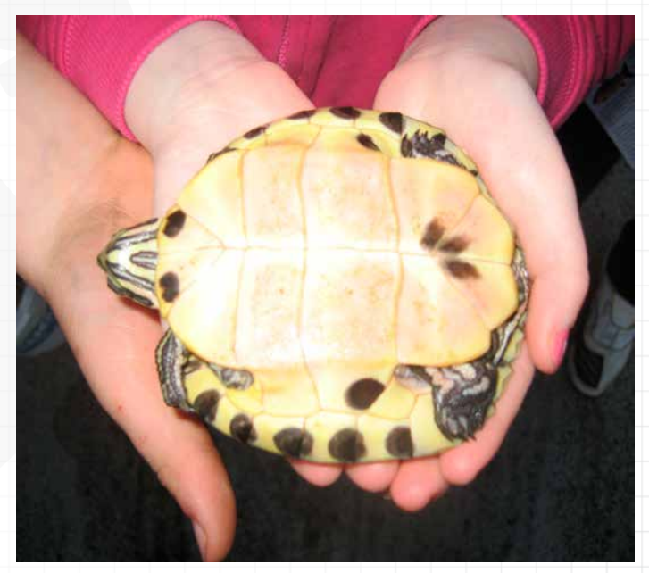
Yellow bellied slider showing yellow plastron with distinctive dark blotches - Dan Minchin