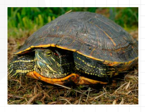
Red-eared slider with head retracting into its shell (carapace)