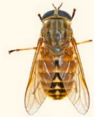
Giant Horsefly Tabanus sudeticus