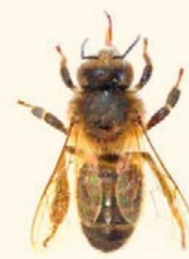
Honeybee Apis mellifera