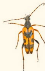
Spotted Longhorn Rutpela maculata