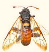
Birch Sawfly Cimbex femoratus