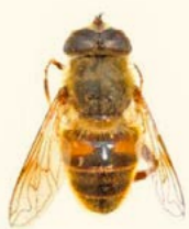
Drone Fly Eristalis tenax